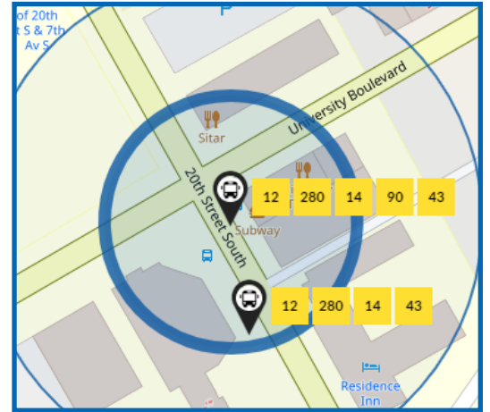
Five Points South